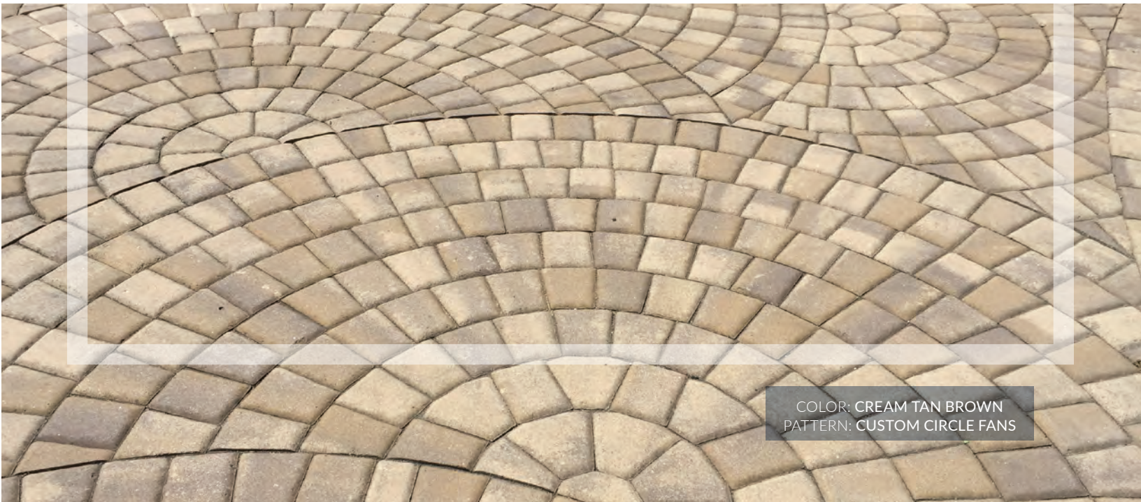
COLOR: CREAM TAN BROWN PATTERN: CUSTOM CIRCLE FANS