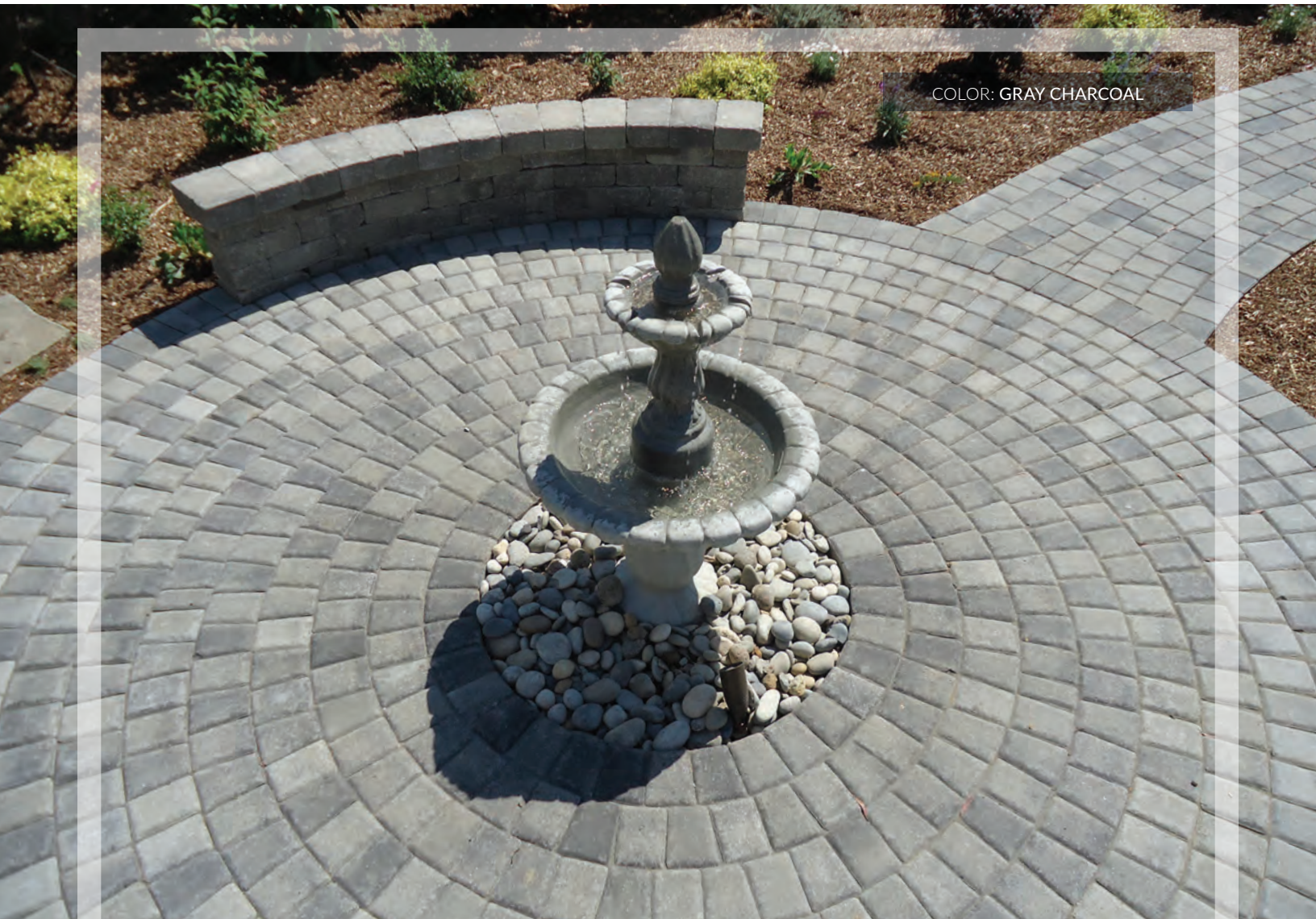
COLOR: GRAY CHARCOAL