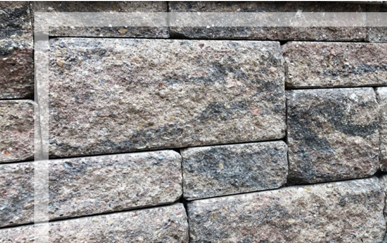
Allan Block Europa captures the natural stone effect that brings distinction to any project. The unique texture creates a stunning look and gives old world charm to any landscape.